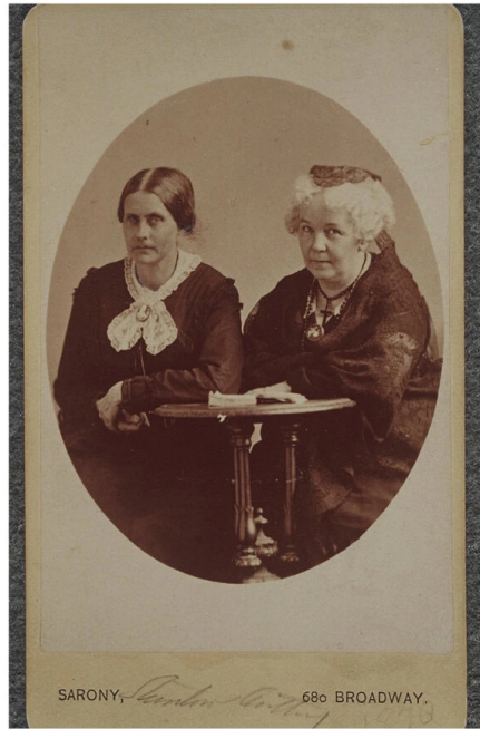
Susan B. Anthony, left, and Elizabeth Cady Stanton. Susan B. Anthony Papers, 1815-1961, Schlesinger Library

Black suffragists, who were often marginalized in white suffrage groups, also created their own portraits, which they hoped would counter racist and sexist stereotypes. In the mid-19th century, the abolitionist and suffragist Sojourner Truth sold “cartes de visite” with her portrait when she went on lecture tours, as a way of establishing her respectability and ownership over her work. When later Black suffragist leaders such as Ida B. Wells-Barnett and Mary McLeod Bethune sat for their own portraits, they, like Stanton and Anthony, dressed in elegant clothing and wore jewelry to project wealth and refinement.