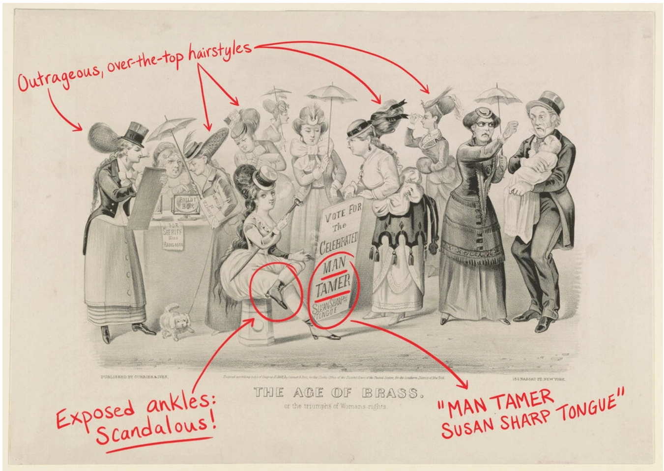
"The Age of Brass."