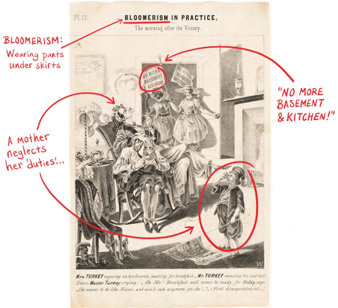
"Bloomerism in Practice."

To counter their opponents' attacks, in the 1870s the suffragists started sitting for portraits, which were sold to consumers to raise money for their cause. They hoped these images would help paint their movement in a more elegant light — a far cry from the cartoonish caricatures in circulation. Everything from their poses to their clothing was carefully considered to help propagate an image of intelligence, morality and refinement.