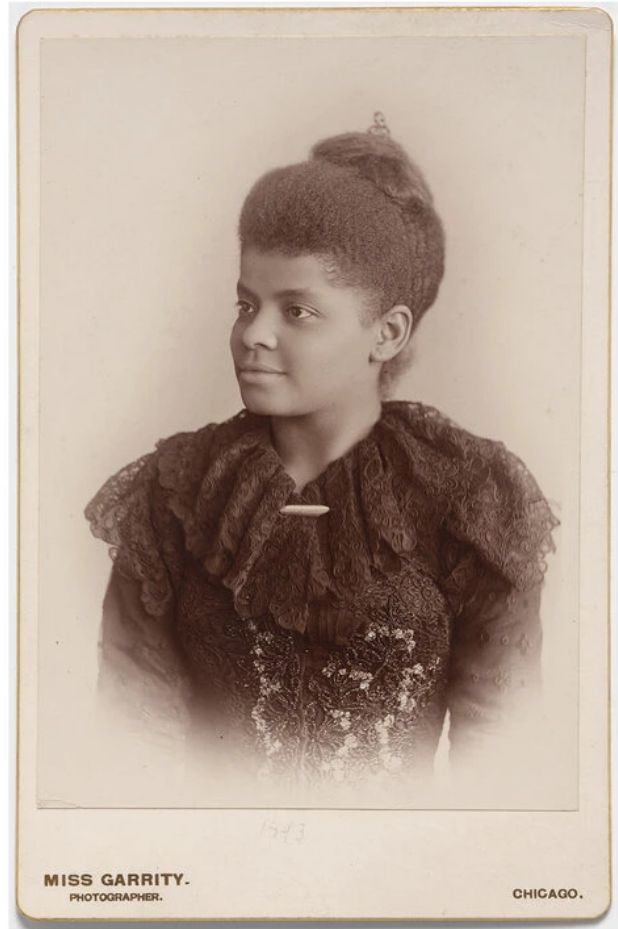
Left, Mary McLeod Bethune; right, Ida B. Wells-Barnett.