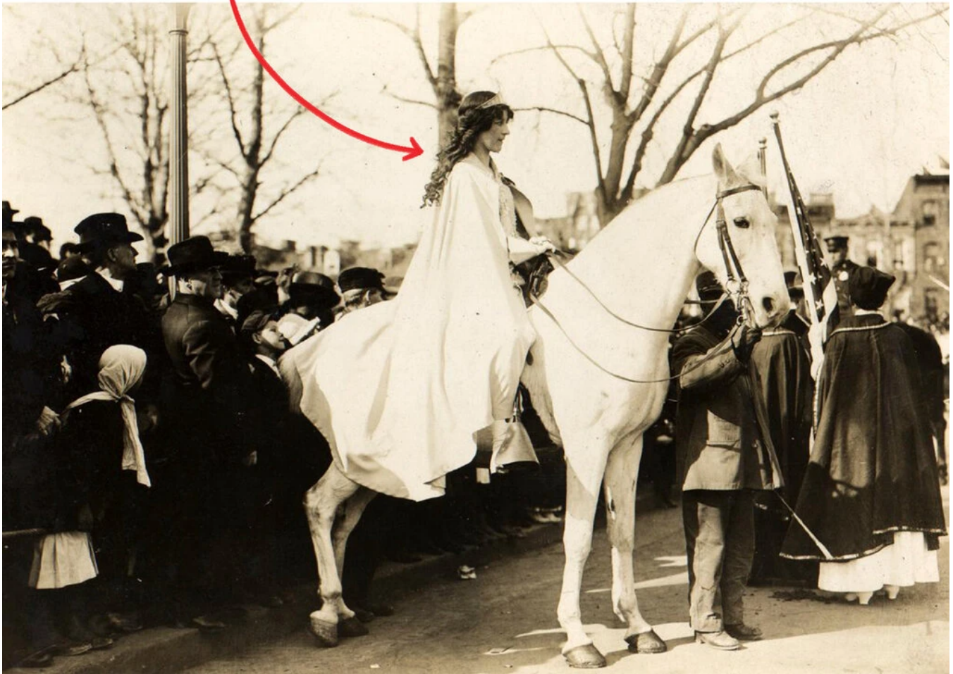
Inez Millholland. — Library of Congress Photo illustration by Chloe Cushman

Inez Millholland: described as " the most beautiful suffragist " in the press