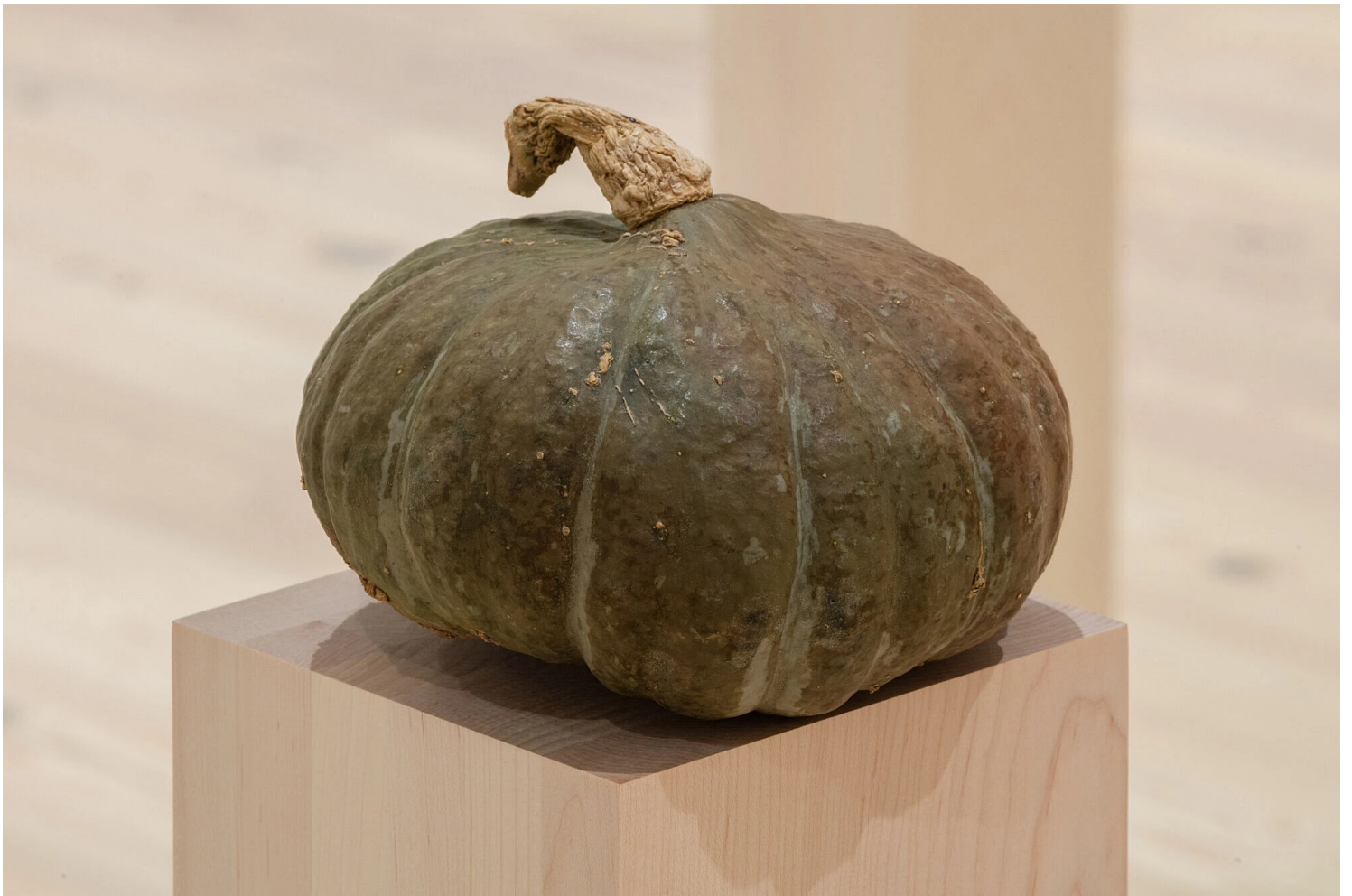
Darren Bader's installation at the Whitney reimagined fruits and vegetables as sculpture.