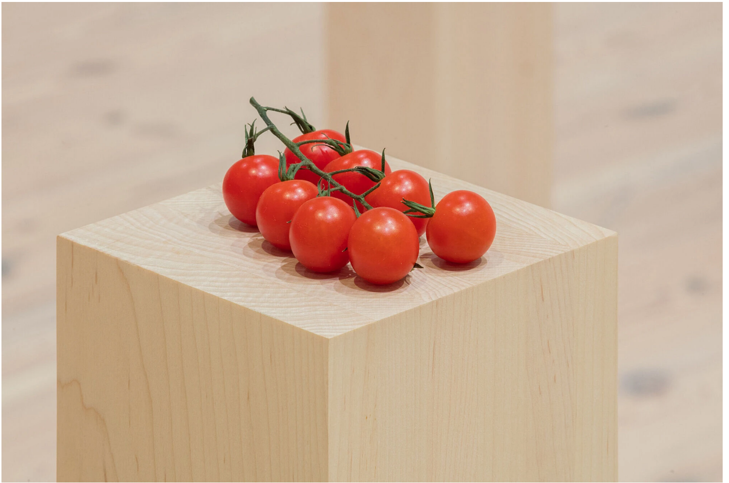
Tomatoes, but also shapes.