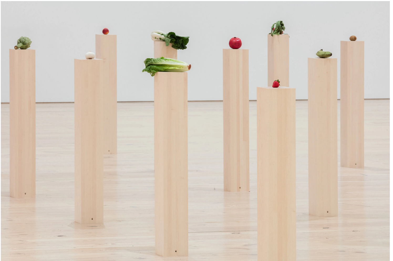
The Bader work, exhibited this year, used pedestals to present the 40 pieces as formal objects.