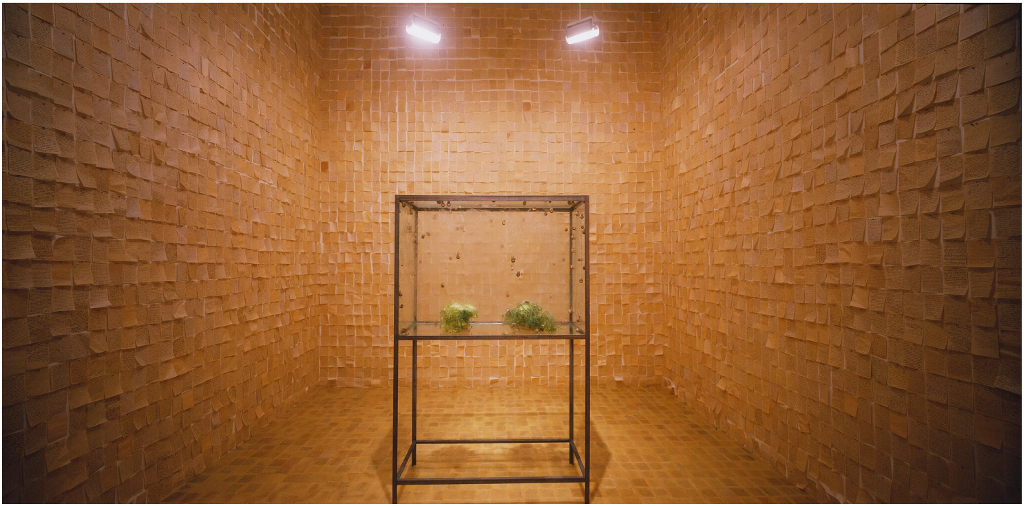
Ann Hamilton's "palimpsest" from 1989, a meditation on memory, included snails that feasted on two heads of cabbage. Ann Hamilton, via Hirshhorn Museum and Sculpture Garden, Smithsonian Institution, Washington

A famous example of art created from organic matter is Yoko Ono's 1966 "Apple," featuring an apple on a plexiglass pedestal. When it was shown at the Museum of Modern Art in 2015, the apple was bought from a store on 53rd Street and replaced a couple of times over the four weeks of the exhibition, said Christophe Cherix, one of the curators who put on the show.