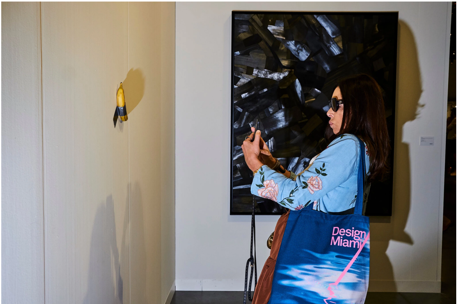
The startling simplicity of “Comedian” drew attention and many selfies in Miami.