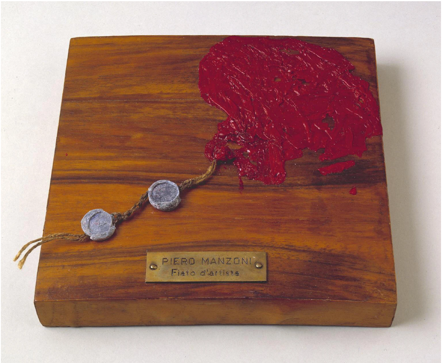
"Artist's Breath," a work from 1960 by the Italian artist Piero Manzoni. The balloon was inflated initially but lost its shape over time. Artists Rights Society (ARS), New York / SIAE, Rome

How does one care for a scale model of an Algerian city made out of couscous? A sculpture made of interlocking tortillas? Fruit stuck on a coatrack? (All works the Guggenheim has shown.)