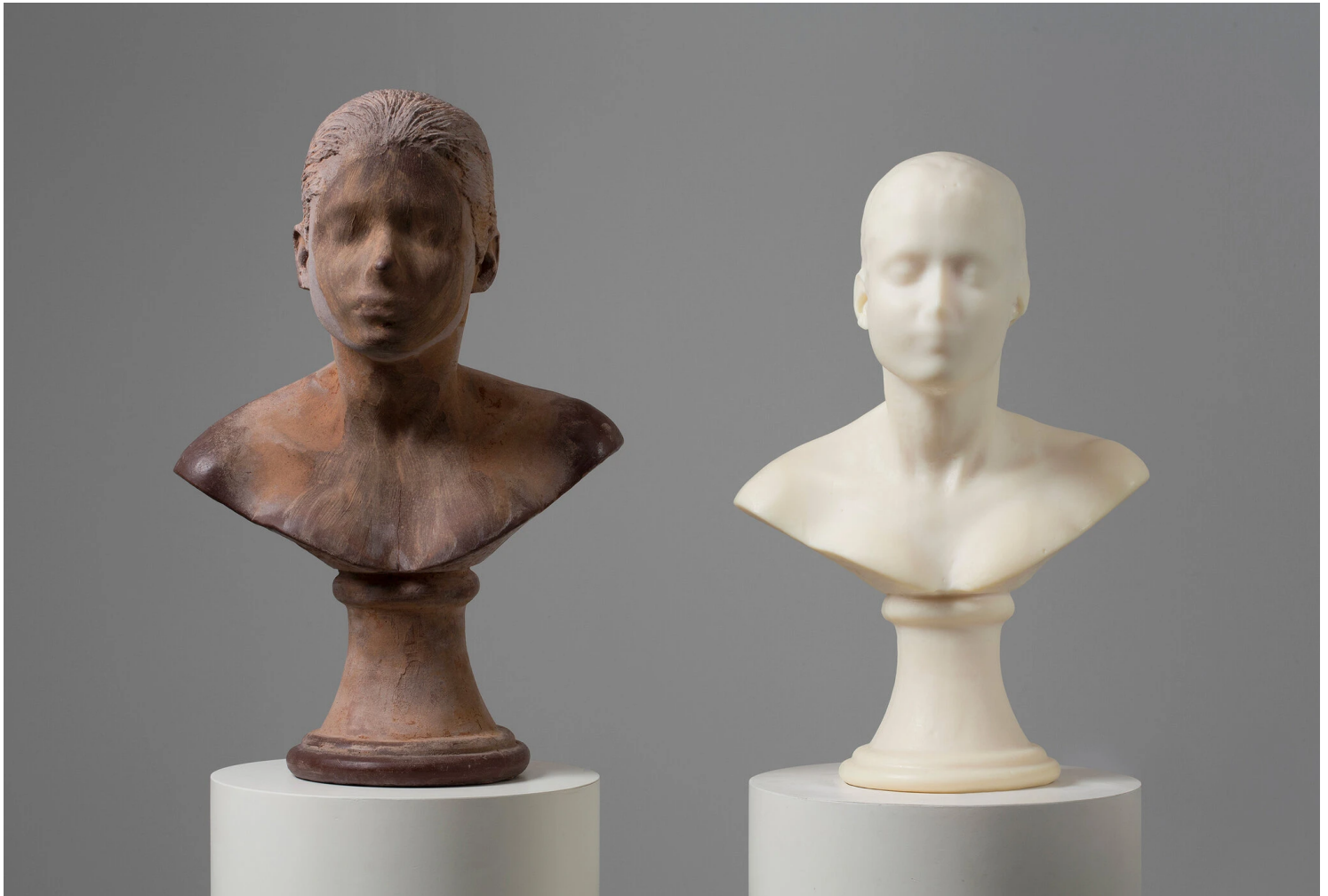
“Lick and Lather” (1993-1994) by the artist Janine Antoni, portraits of the artist in chocolate (left) and soap, which were created from molds and then licked or washed by the artist. HirshhornMuseum and Sculpture Garden, Smithsonian Institution

The focus is so much on the idea that, in some cases, the materials do not outlast the end of the exhibition. Like the works involving bananas or couscous, the art object is thrown away but the art idea lives on, to be recreated in the future according to the artist's instructions.