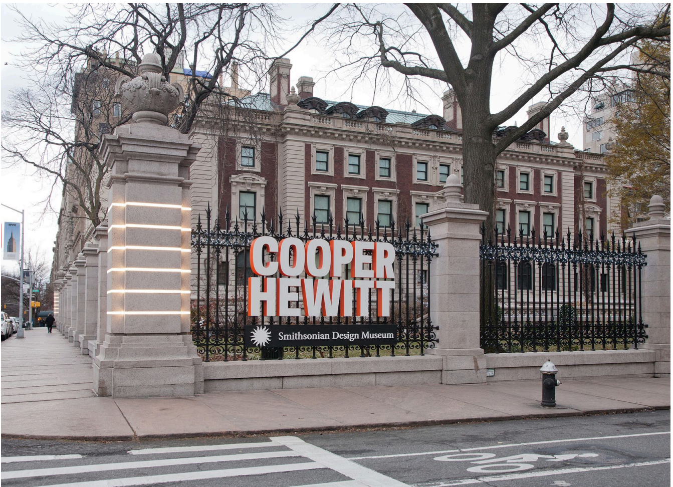
The Cooper Hewitt, Smithsonian Design Museum in New York Cooper Hewitt, Smithsonian Design Museum

The Smithsonian Institution, which reopened seven of its museums and the National Zoo this month, announced today that it would reopen its remaining 10 museums on a staggered schedule in June through August,