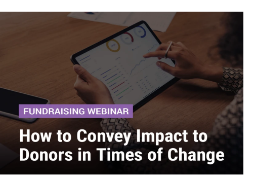
How to Convey Impact to Donors in Times of Change

How to Host Hybrid Events Donors Want to Attend