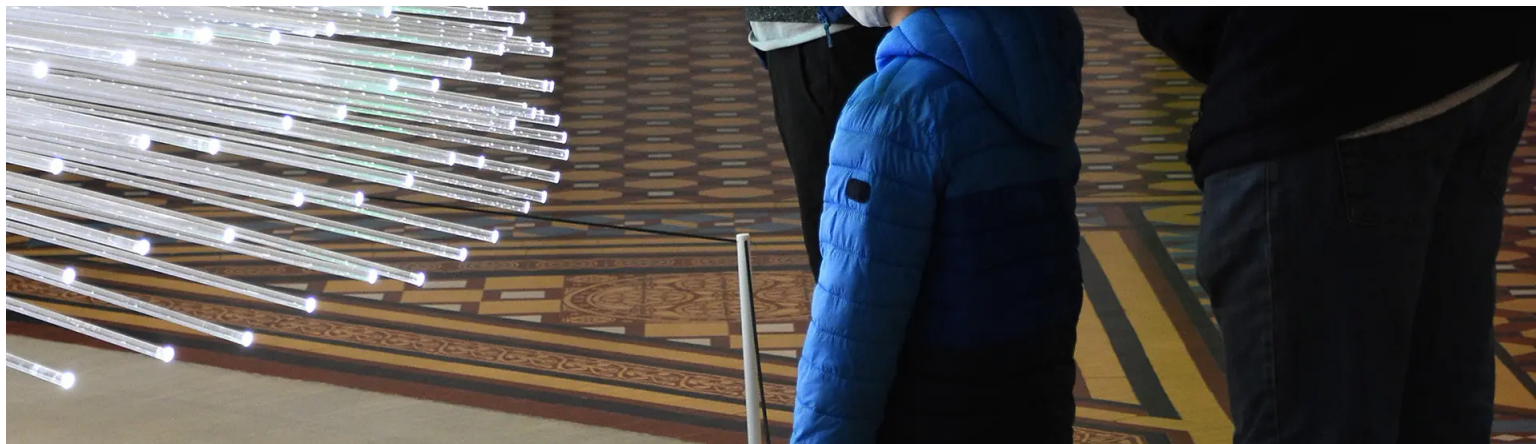
Visitors at the Smithsonian's Arts and Industries Building in December 2021