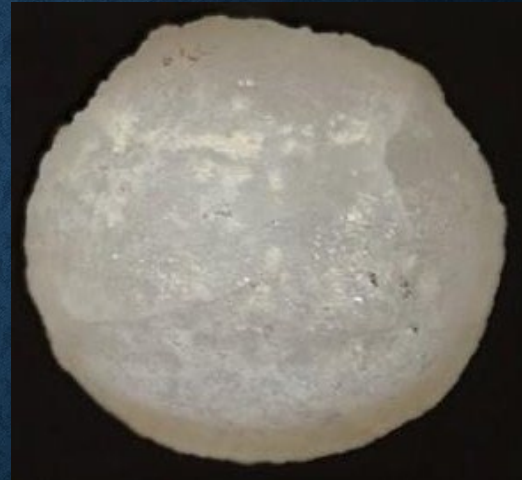
Smithsonite Broken Hill, New South Wales, Australia