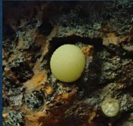
Smithsonite Silver Star Mine, Madison County, Montana