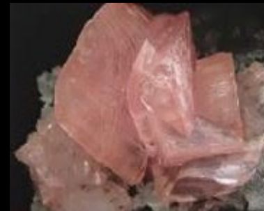
Tsumeb Namibia SW Africa