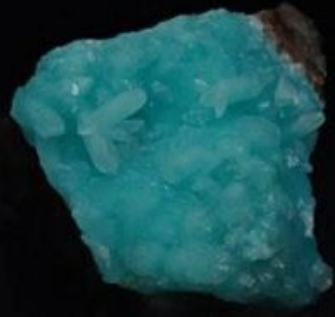
Kelly Mine New Mexico USA