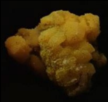
Karlovy Vary Czechoslovakia