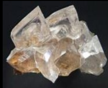
Tsumeb Namibia SW Africa