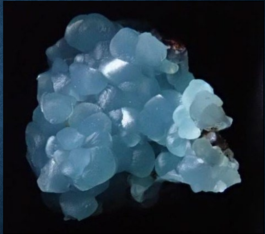
Smithsonite - Kelly Mine, Magdalena District, Socorro County, New Mexico